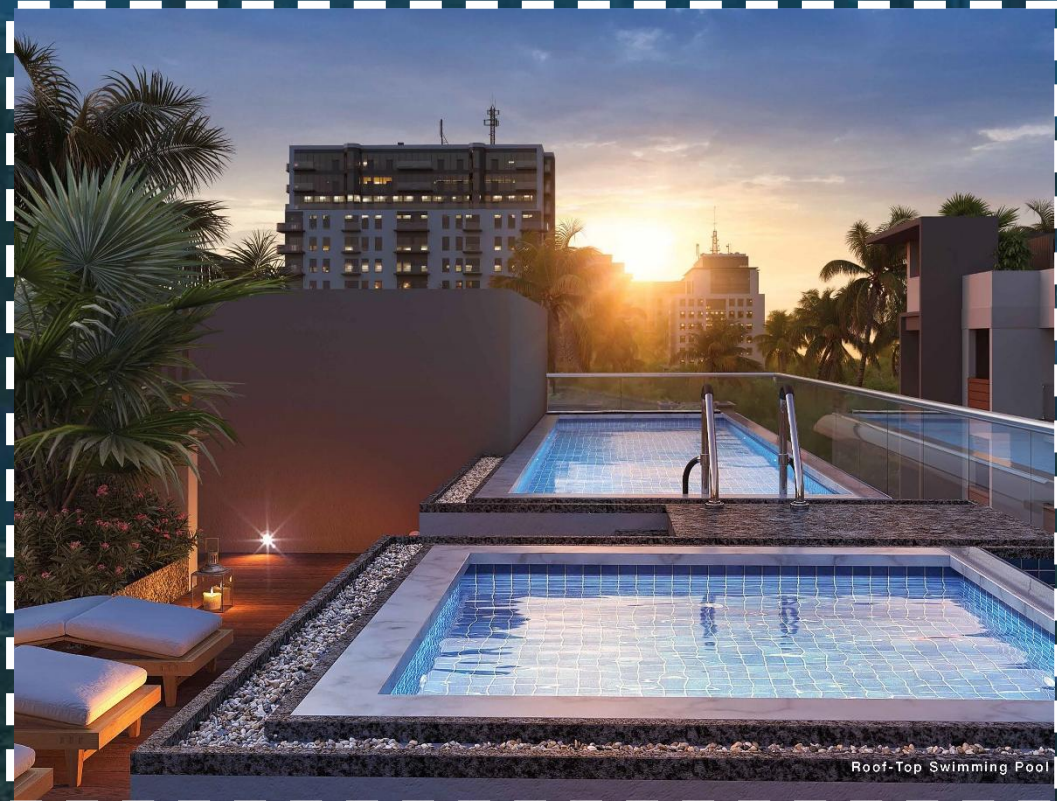
ROOFTOP SWIMMING POOL